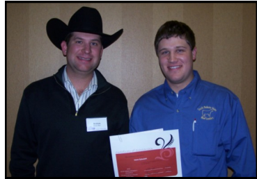
One of the 2011 Scholarship Recipients