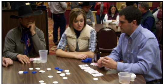
Playing poker during the YPC Texas Hold 'Em Tournament