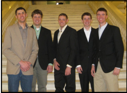
2011 Cattlemen at the Capitol